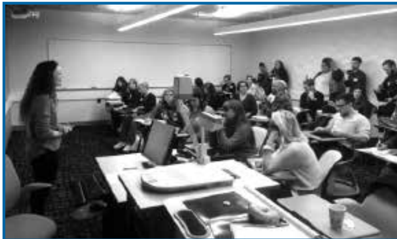
Anna White Presenting on Citation Practices for Consultants and Students