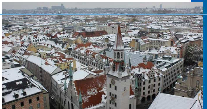
Prague, Czech Republic