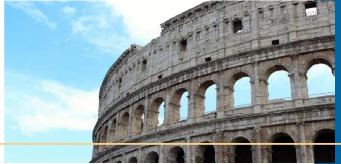
Colosseum - Rome, Italy

Check out the kinds of places your fellow Lakers are visiting through Study Abroad!