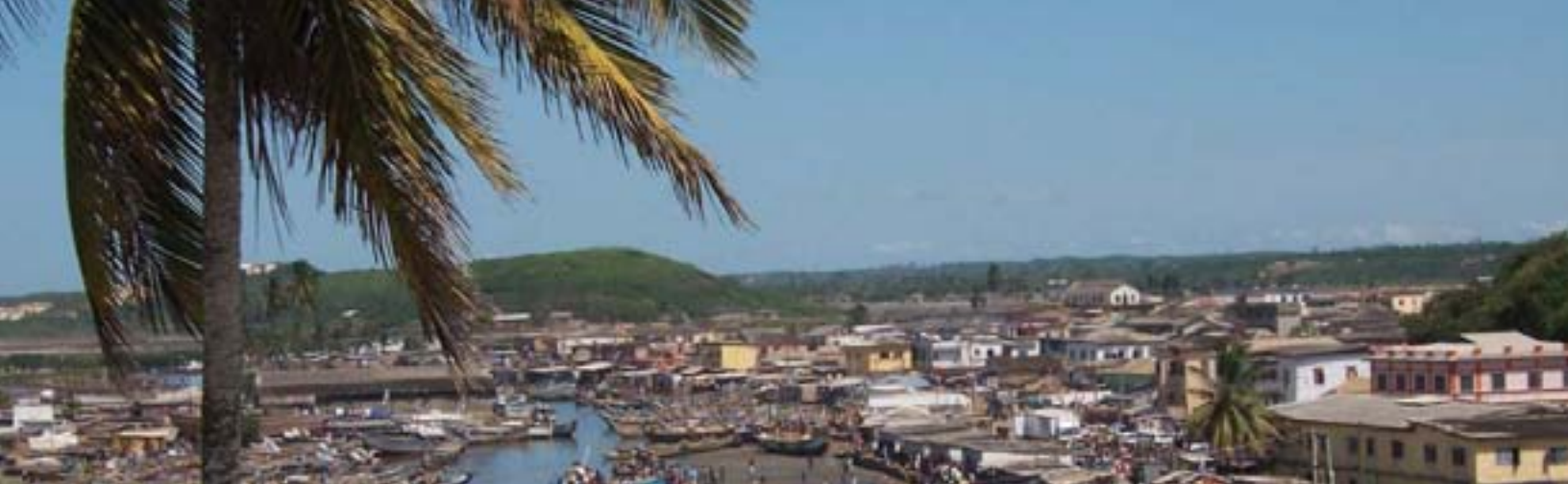
Ghanaian fishing village.

different...just a little less worse than in the castle. We know it wasn't. But it was this hope that sustained and nourished their souls during the middle passage and as they were scattered throughout the Americas and the Caribbean, from Brazil to Barbados, from Mississippi to Missouri. It is this hope that made millions of Africa's sons and daughters survive and rise up again on lands unknown to those who went through this door of no return...door of sorrow and hope.