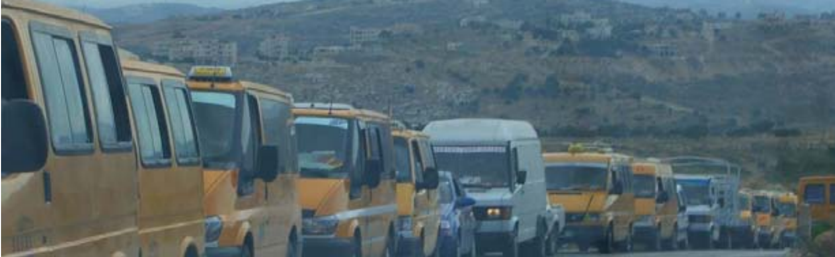
Palestinian taxis waiting at Israeli road block near BirZeit University.