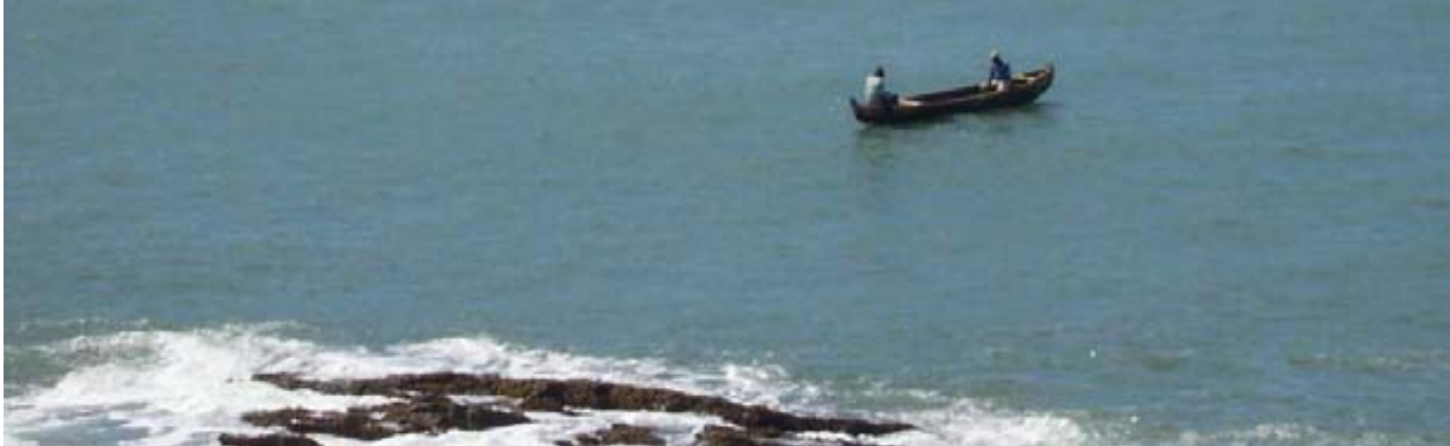
Ghanaian fishermen. Photo courtesy Jacques Mangala.