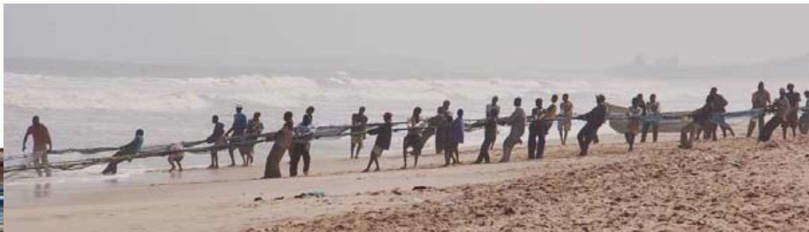
Ghanaian fisherman.