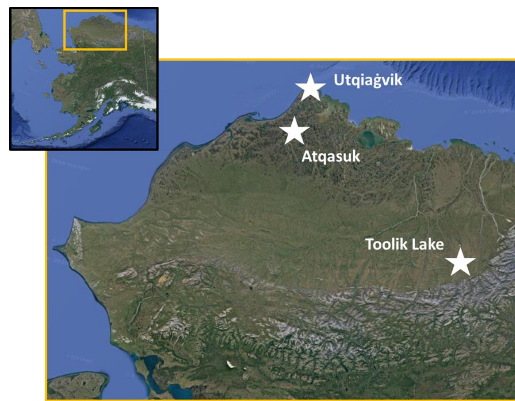
Fig 1: Location of study sites near Utqiagvik, Atkasuk, and Toolik Lake, Alaska.

The Arctic is the fastest warming biome in the world, with average temperatures increasing twice the rate of the global average (IPCC 2018). Plant communities are particularly sensitive to changes in temperature, and this effect is exaggerated in the Arctic where a short growing season and low average temperatures severely limit plant growth. Many studies have documented changes in community composition in the Arctic with increases in evergreen shrubs, deciduous shrubs, and graminoids and decreases in bryophytes and lichens being the most consistent trends across sites (Elmendorf et al. 2012; Hollister et al. 2015). Recent studies have documented shifts in plant performance with increased climate warming, causing plant functional traits to become increasingly popular in recent years to study vegetation responses to changing environmental conditions (Hudson et al. 2011; Bjorkman et al. 2018). Plant functional traits strongly correlate with ecosystem functioning which further impact climate changes (Cornelissen et al. 2007; Pearson et al. 2013). In this study we examine 10 functional traits related to plant size and leaf economics across three sites in northern Alaska (Fig 1). We aim to 1) determine whether there is a direct relationship between shifts in species abundances and specific trait values and 2) assess whether community-weighted trait mean values are shifting with species cover over time.