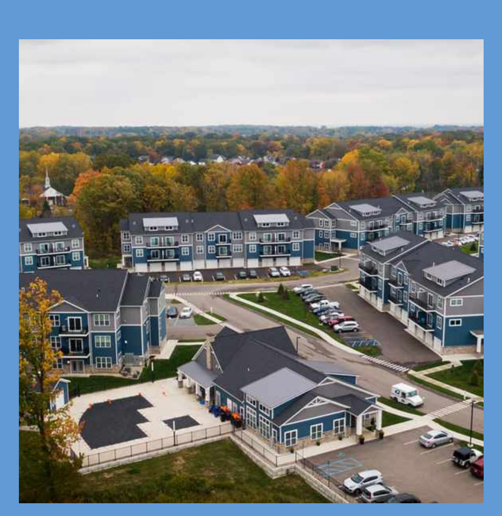
Westown at Wilson Apartment Homes