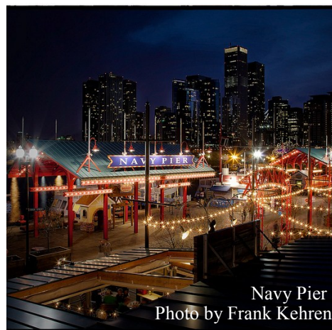
Navy Pier