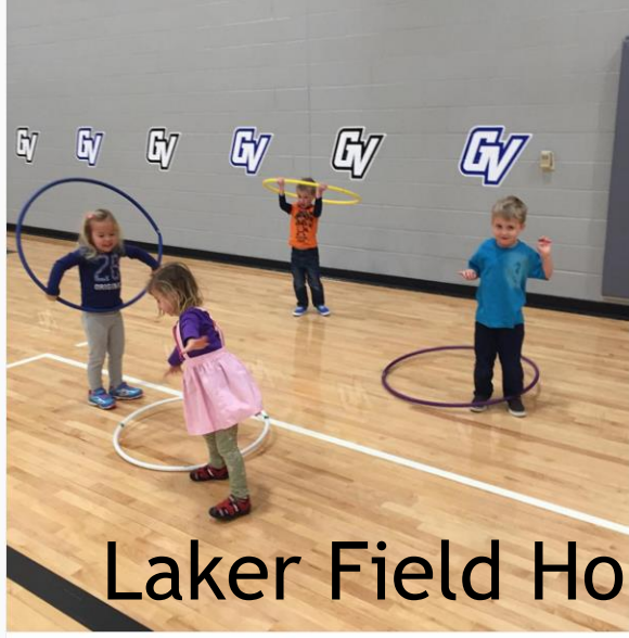
Laker Field House