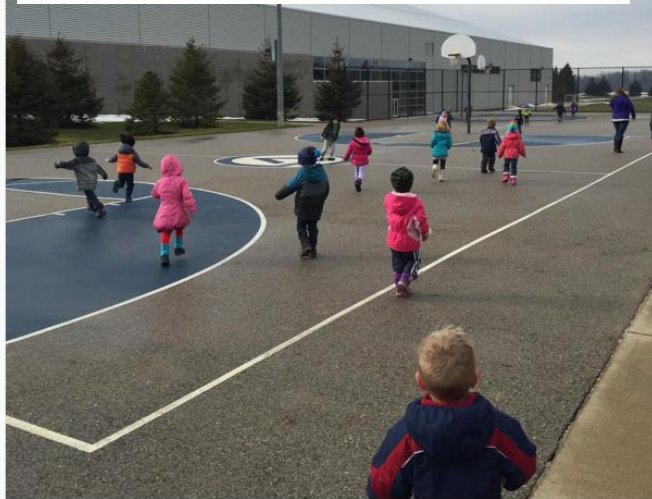
Outdoor Basketball Courts