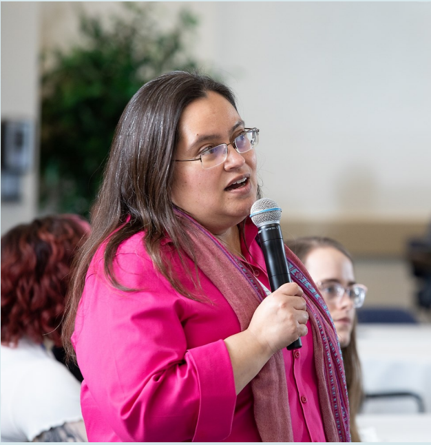
Welcoming our community to the 2022 Annual Local History Roundtable.