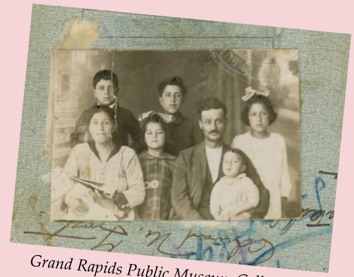
Grand Rapids Public Museum Collection

In the early 1900s, thousands of people emigrated from Greater Syria and settled in the Midwest. Grand Rapids had a large Syrian population of shopkeepers and railroad workers, who founded Christian churches and Muslim societies in the city while building up key aspects of the area's twentieth-century infrastructure.