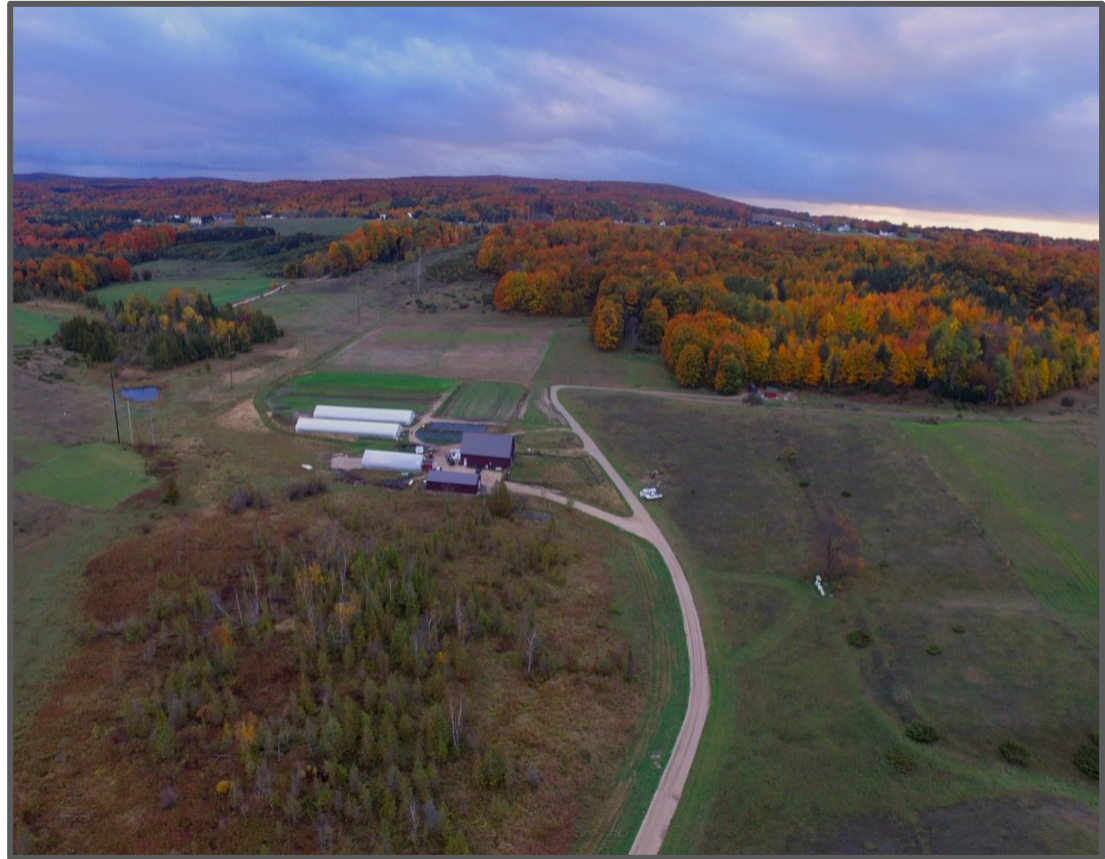
Bear Creek Organic Farm - Petoskey, Michigan's first-ever 100% USDA Certified Organic Farm