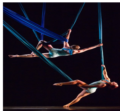
Pictured: Aerial Dance Chicago

Thursdays: Free Night at the Grand Rapids Art Museum , 101 Monroe, 7-9 p.m. in November. Contact: 831-1000