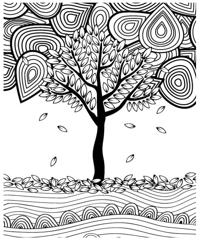
Falling Leaves by Nerdy Food Mom Free Coloring Page