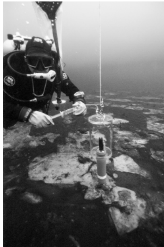
Divers use syringes to collect samples from inside the chambers custom-developed by AWRI.