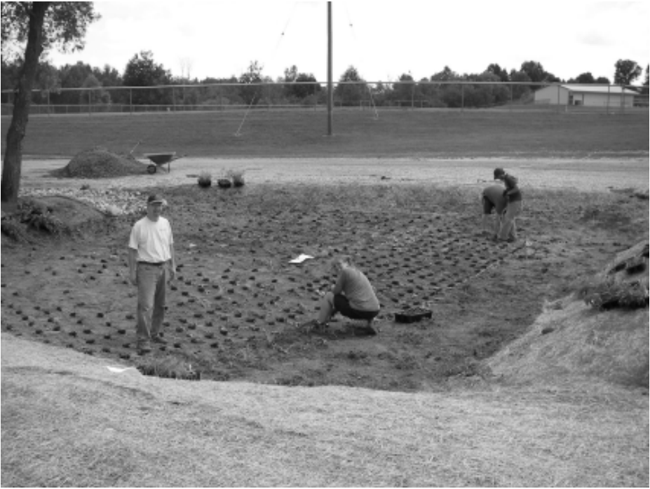
Left: ISC staff plant seedlings at the McBain Park rain garden.