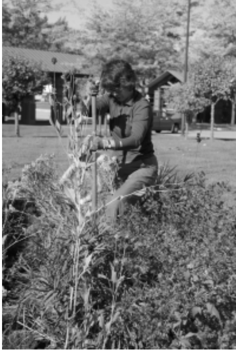
Below: Maintenance of rain garden in second year of growth at City of Walker Library.

feature of the landscape. Rain gardens attract birds, butterflies, and other desirable wildlife. Plus, they greatly improve water quality.