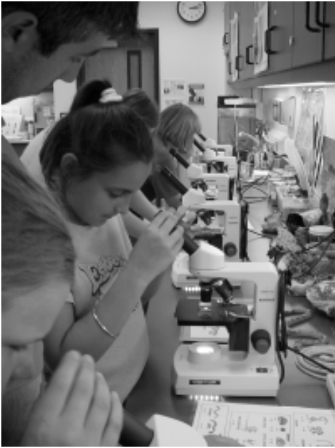
Cherry Creek Elem. students participate in educational opportunities at LMC.