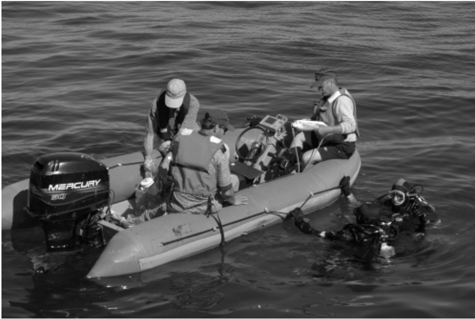
Scientists on Zodiac boats direct divers over the Middle Island sinkhole.

Since 2001 when the first submerged sinkhole was discovered, the team has identified and is studying three sinkhole communities in the Thunder Bay National Marine Sanctuary, located in Lake Huron. They postulate that sinkholes were created when the ancient limestone bedrock of Lake Huron slowly dissolved, opening up passages or holes in the rock and allowing groundwater to vent into Lake Huron. The captured and now released groundwater could be thousands of years old and constitutes a suite of highly unusual microorganisms and a chemical composition radically different from the rest of the lake.