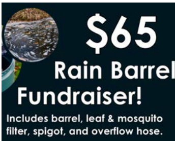
Rain Barrel Fundraising Flyer

Learn more on our CECI WAVE webpage, events section . Please share this event with your students!