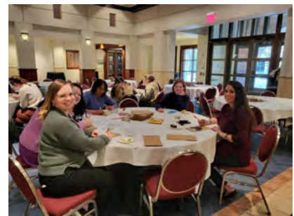
Bag-a-Thon at Loosemore Auditorium