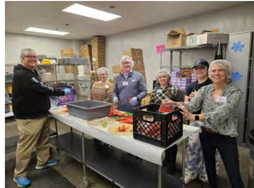
Volunteer Event at Kid's Food Basket