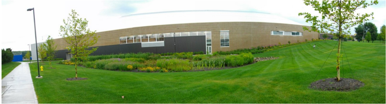
Photo taken August 2009 of the rain garden and monitoring sites located near the Laker Turf Building, GVSU.