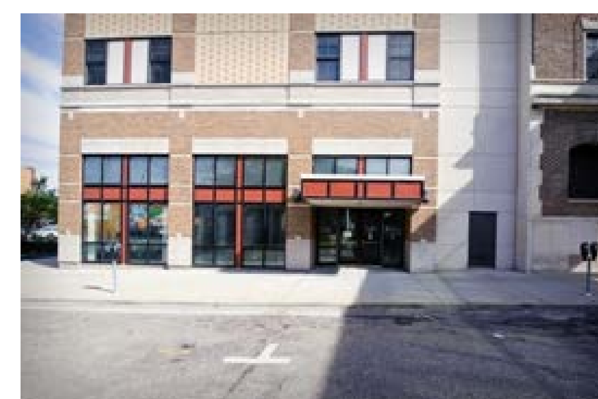
Grand Valley State University's Family Health Center located at 72 Sheldon Blvd. SE Grand Rapids, MI