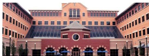
Richard M. DeVos Center Loosemore Auditorium Building, 5E on the map above

Grand Valley State University 401 Fulton Street West Grand Rapids, MI 49504