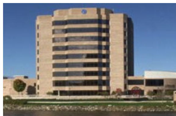
Eberhard Center #6 on the map above

Grand Valley State University 301 West Fulton Street Grand Rapids, MI 49504-6495