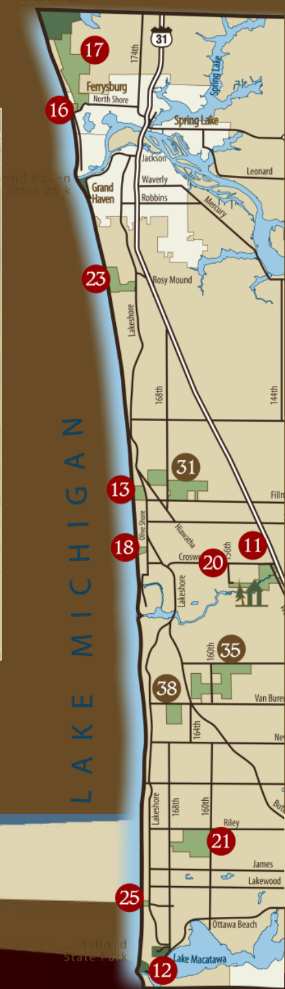
Dog Beach Access