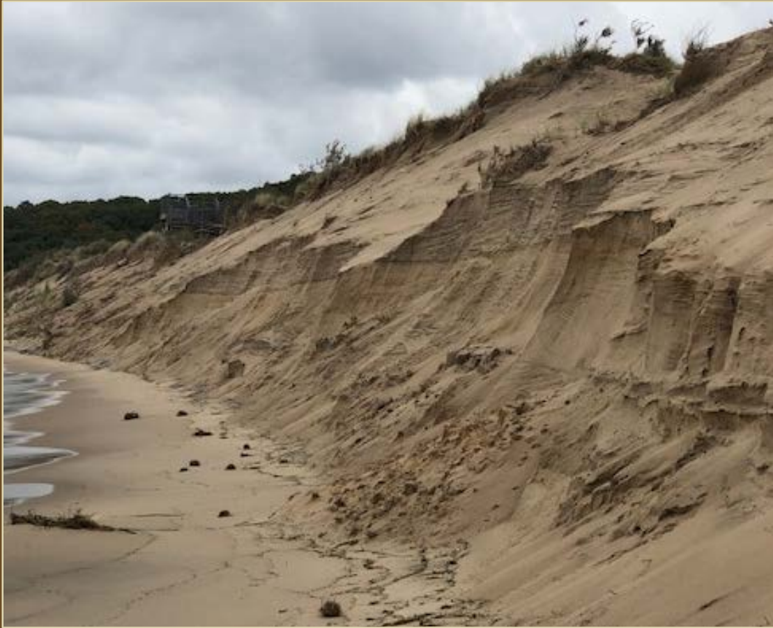
Loss of Foredune