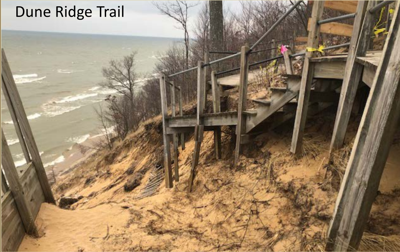
Dune Ridge Trail