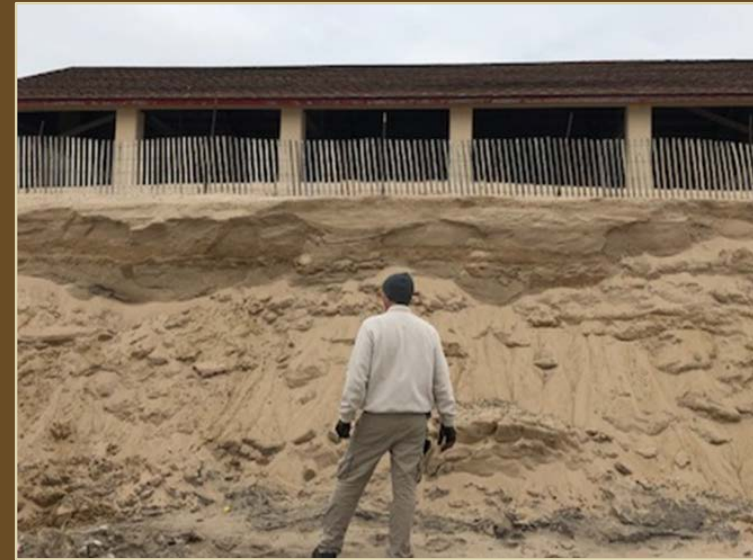
North Beach Park