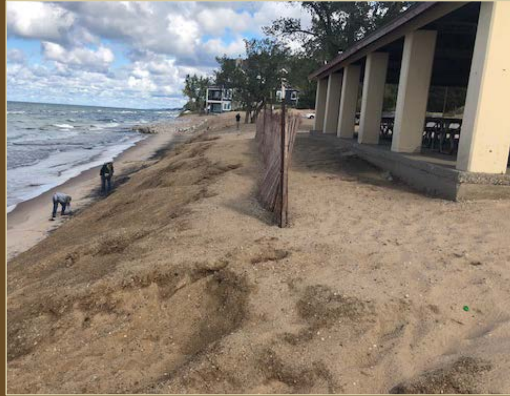
North Beach Park