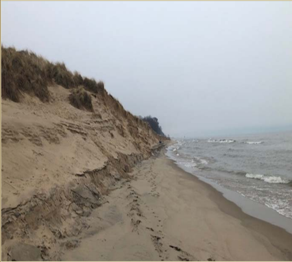
Loss of Foredune