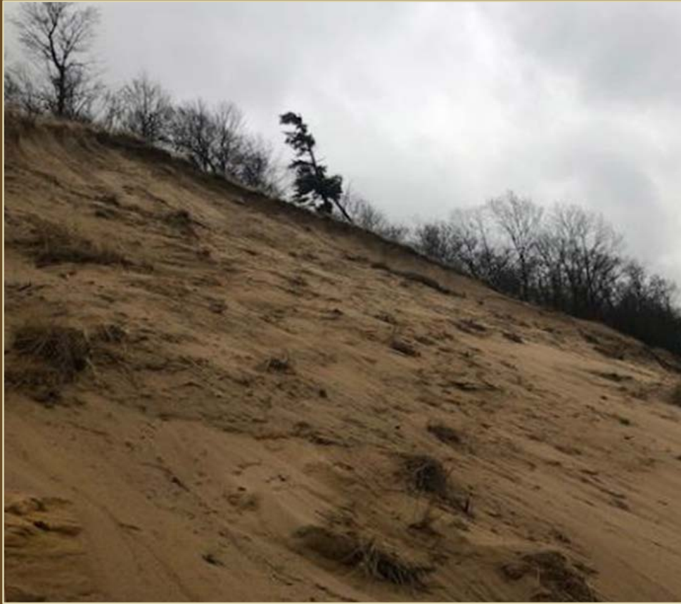
Loss of primary dune