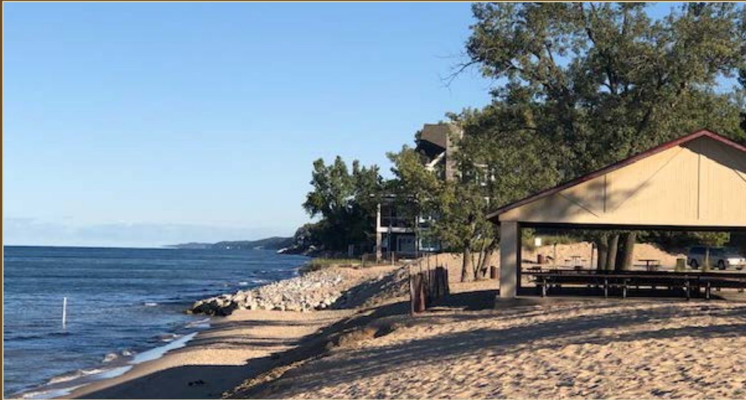
North Beach Park