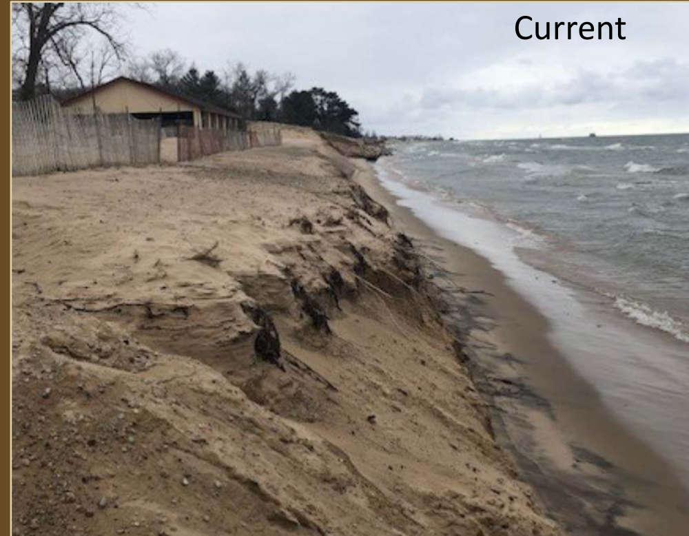
North Beach Park