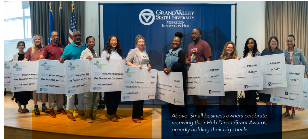
Above: Small business owners celebrate receiving their Hub Direct Grant Awards, proudly holding their big checks.

The Michigan Business Accelerator Fund (BAF) provides grants through SmartZone accelerators, including the Hub, to support early-stage, high-tech Michigan companies. Awards typically range from $7K-$15K , with up to $75K available for services like marketing, patents, or financial modeling — helping businesses achieve critical milestones, accelerate commercialization, and create jobs.