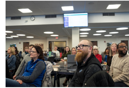
Workday Student Project team members attend onsite meeting.

January marked significant progress on the Workday Student implementation. During the week of January 12, GVSU welcomed Alchemy, the university's Workday Student implementation partner, for an onsite visit.