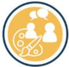
Communication & The Arts