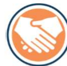
Business & Entrepreneurship