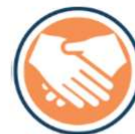
Business & Entrepreneurship