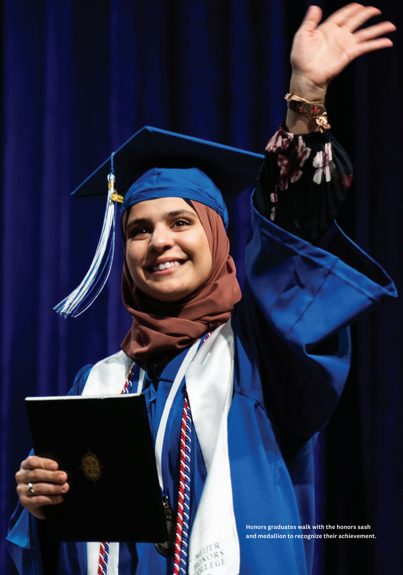
Honors graduates walk with the honors sash and medallion to recognize their achievement.