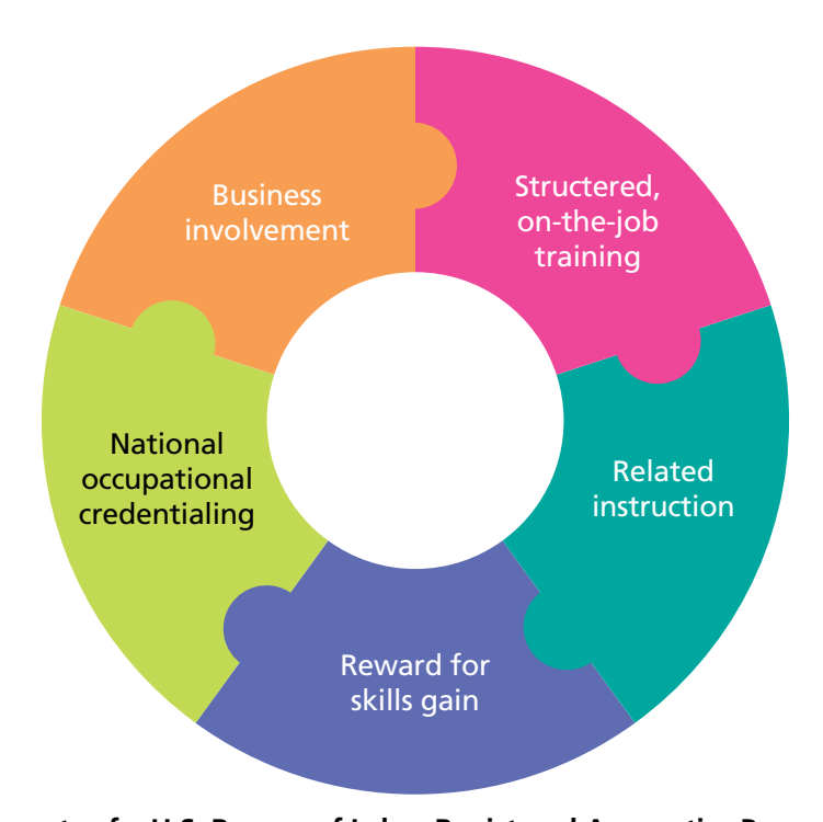
Figure 1. Elements of a U.S. Bureau of Labor Registered Apprentice Program