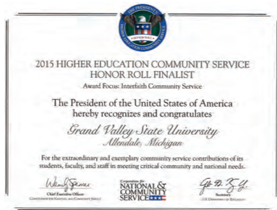
The Higher Education Community Service Honor Roll Finalist certificate, presented by the President of the United States to GVSU.

Significant support for connecting to young people was an initiative taken on by then-President Barack Obama in establishing the White House Office of Faith-Based and Neighborhood Partnerships. When President Obama announced the program, he referred to his own experiences in community service and how it shaped his understanding of how people working together can accomplish a great deal without erasing their religious differences. His administration created The President's Interfaith and Community Service Campus Challenge in 2011, where over 500 schools became involved over five years.