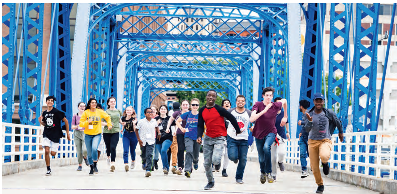
Youth Interfaith Service Day Camp participants running to their next activity.

The Kaufman Institute's increased attention to campus programming and on-campus interfaith internships at local colleges was an important outcome of the pandemic, while also continuing to grow new ventures with high school youth. The institute's engagement with younger generations brought new energy and ideas to its programming, while also creating promising connections for its future leadership. Two key Kaufman Institute initiatives in working with younger generations are its Youth Interfaith Service Day Camps, 77 held during the summer for middle- and high-school students, and Kaufman Interfaith Leadership Scholars, 78 which brings together eighth- through twelfth-graders throughout the school year to study common texts and put their learning into action through collaborative projects.