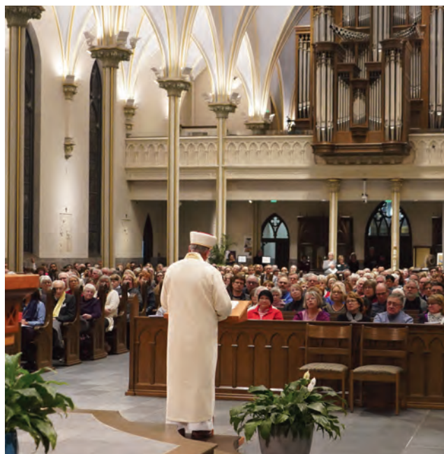
Thanksgiving event at St. Andrew's Cathedral.

The events of September 11, 2001 drew attention as never before to the status of Muslims in the United States and underlined the urgent need to engage in dialogue with Muslim neighbors. For many, heightened