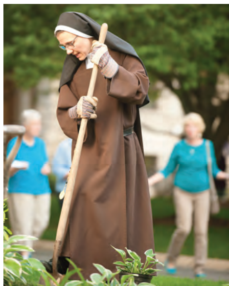
Franciscan sister planting a tree at the Dominican Center.

Perhaps the most ambitious and creative program during the pandemic's isolation was the April 2021 Grand Dialogue in Science and Religion. Kaufman Institute staff took advantage of the opportunity despite the necessity for online programming. It focused on "Healing our Earth," revisiting the theme from the canceled 2020 event. Spaces were offered throughout the month that amplified wisdom, insights, and work pertaining to environmental action from numerous traditions and organizations. Two panel discussions were featured, leading into the week of Earth Day on April 22, 2021.