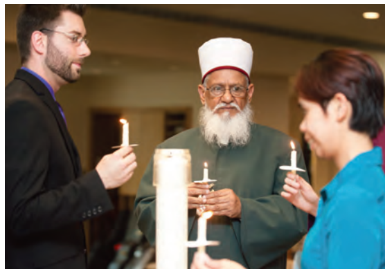
Memorial service prior to the COVID-19 shutdown.