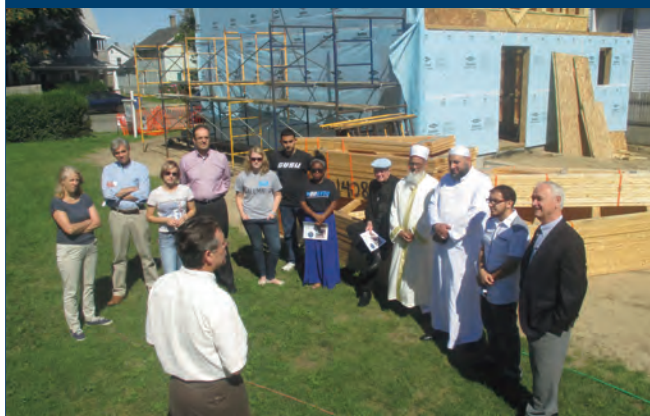
Interfaith workers and faith leaders meet at beginning of Habitat for Humanity build.