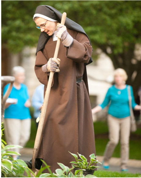
Franciscan sister planting a tree at the Dominican Center.

Perhaps the most ambitious and creative program during the pandemic's isolation was the April 2021 Grand Dialogue in Science and Religion. Kaufman Institute staff took advantage of the opportunity despite the necessity for online programming. It focused on "Healing our Earth," revisiting the theme from the canceled 2020 event. Spaces were offered throughout the month that amplified wisdom, insights, and work pertaining to environmental action from numerous traditions and organizations. Two panel discussions were featured, leading into the week of Earth Day on April 22, 2021.