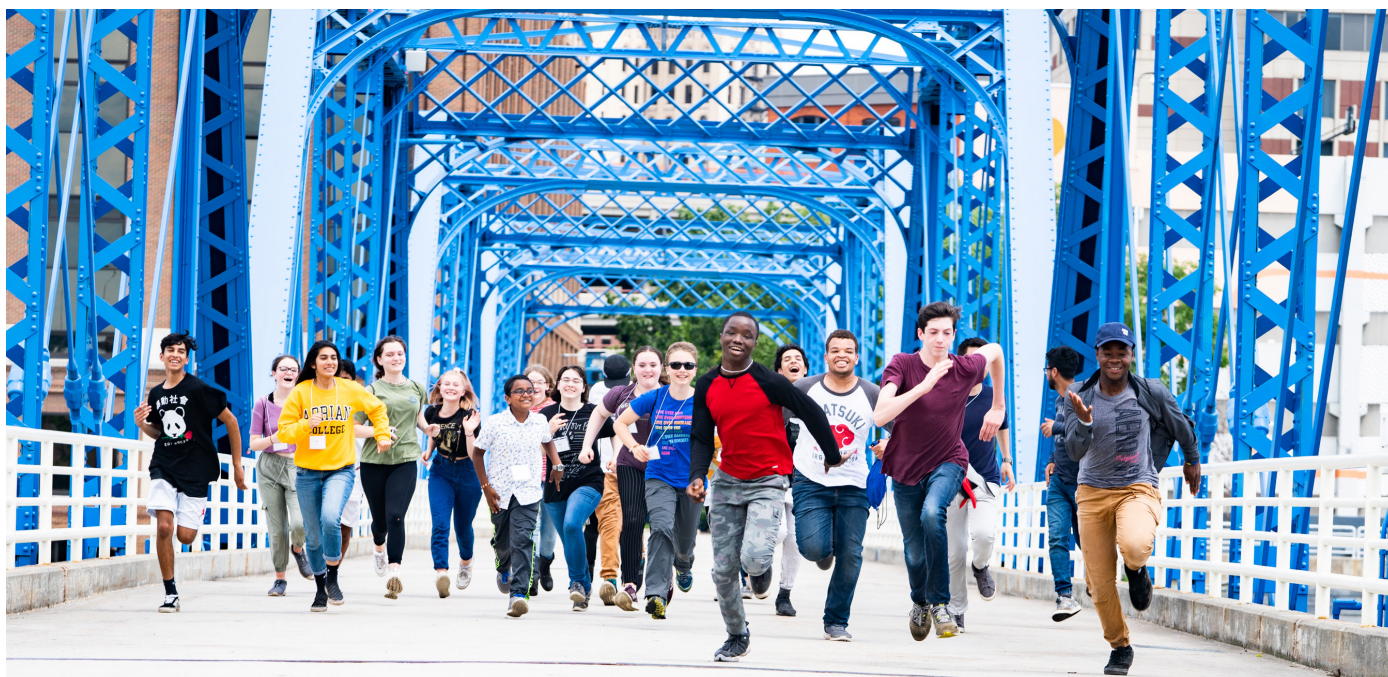
Youth Interfaith Service Day Camp participants running to their next activity.

The Kaufman Institute's increased attention to campus programming and on-campus interfaith internships at local colleges was an important outcome of the pandemic, while also continuing to grow new ventures with high school youth. The institute's engagement with younger generations brought new energy and ideas to its programming, while also creating promising connections for its future leadership. Two key Kaufman Institute initiatives in working with younger generations are its Youth Interfaith Service Day Camps, 77 held during the summer for middle-and high-school students, and Kaufman Interfaith Leadership Scholars, 78 which brings together eighth- through twelfth-graders throughout the school year to study common texts and put their learning into action through collaborative projects.