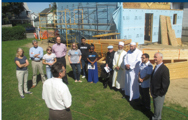
Interfaith workers and faith leaders meet at beginning of Habitat for Humanity build.