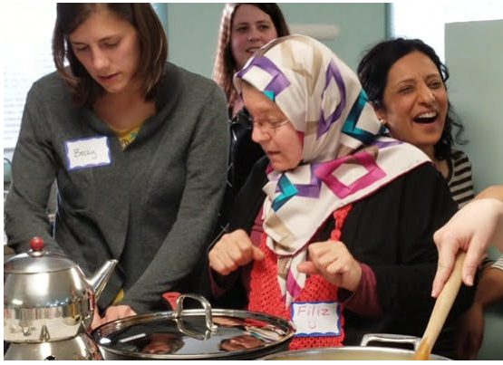
The Interfaith Foodies group meets to prepare ethnic meals.

fritters) for an Iftar meal. “The whole idea of cooking together is different than just sharing a meal together,” Ahmed-Usmani said. “You let your guard down a little more when you’re just conversing over chopping up a salad. It just kind of opens up authentic close-proximity relationships with other people.” 52