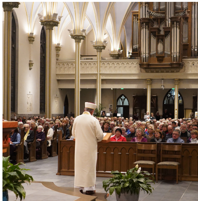
Thanksgiving event at St. Andrew's Cathedral.

The events of September 11, 2001 drew attention as never before to the status of Muslims in the United States and underlined the urgent need to engage in dialogue with Muslim neighbors. For many, heightened