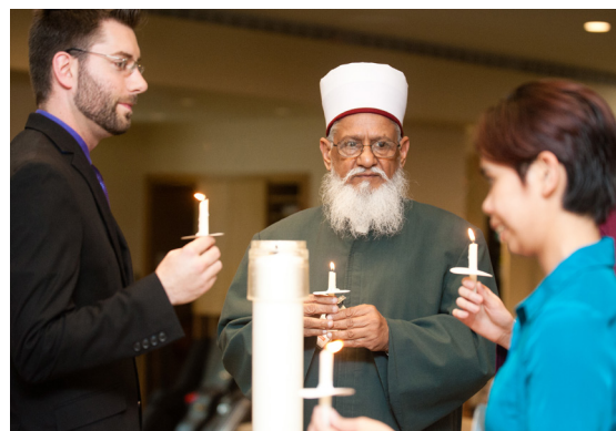
Memorial service prior to the COVID-19 shutdown.