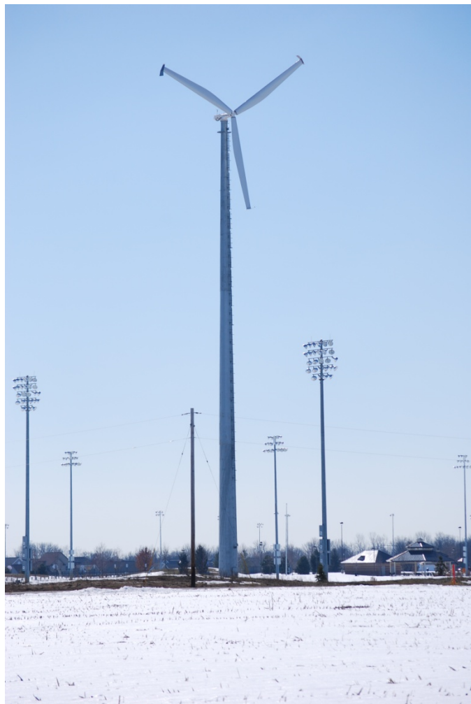
Figure 2. One of two 50 kW turbines in near Zeeland, Michigan. Each tower is 125 feet tall.

As recent experiences in West Michigan demonstrate, varieties of groups organize and become involved in the process of reviewing a wind energy project. An analysis of wind energy projects in England, Wales, and Denmark found that projects “with high levels of participatory planning are more likely to be publicly accepted and successful” [7, p. 2658]. High levels of information and public participation were also associated with successful projects in France and Germany [8]. Stable supporting networks are more likely to form when public participation is high. However the presence of these groups is not mandatory for project acceptance and deployment. More important to deployment was the presence of opposition groups. The absence of a stable network of opponents was linked to project acceptance and deployment [7]. The knowledge, attitudes, and values that West Michigan residents hold about energy development, quality of life, and the community engagement process may similarly influence public participation.