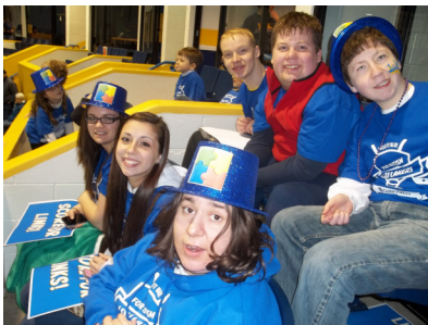
Eastern U.P. students at a LINKS event

Special thanks to the staff and students at Grand Haven High School, Haslett High School, Hemlock High School, Lapeer West High School, and Sault Area High School for their participation in this project.