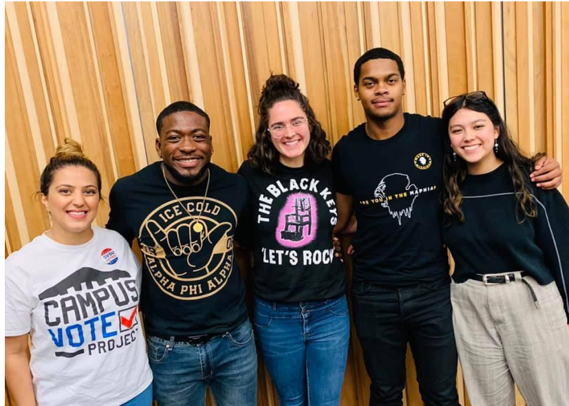
Democracy 101: Youth Political Engagement panel