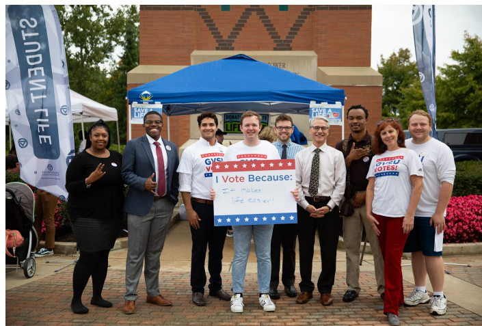
National Voter Registration Day 2018