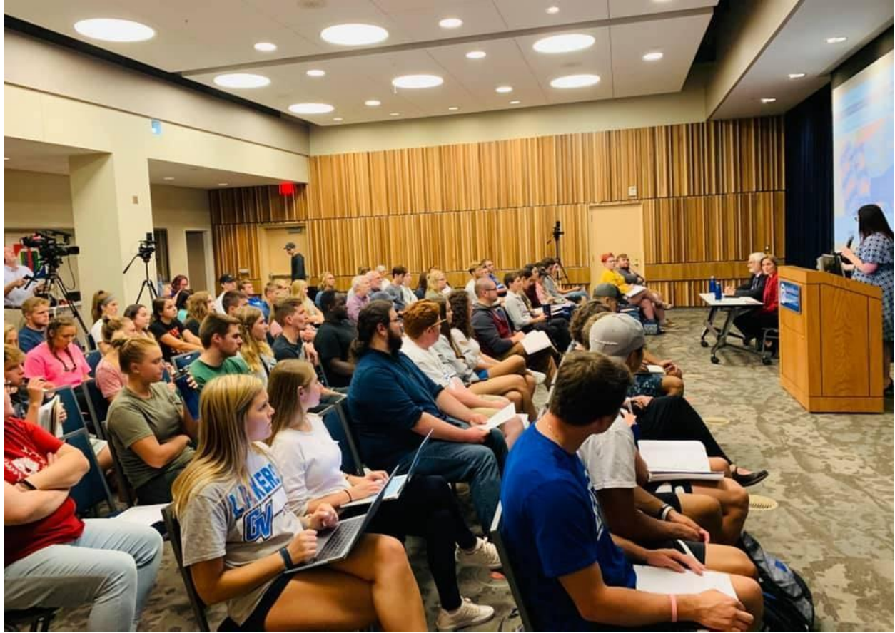
Democracy 101: "PFAS in Michigan"