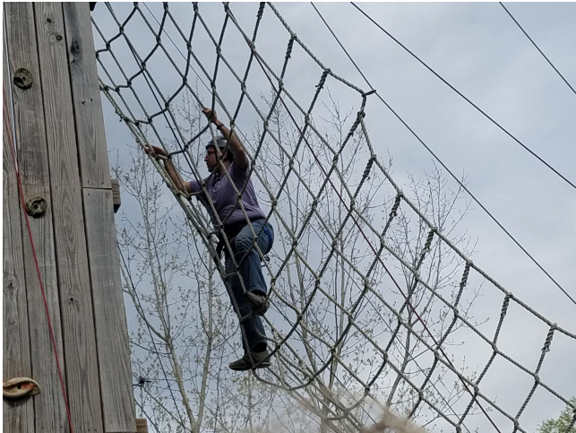
Figure: Zip line at 5 th grade camp (2019)