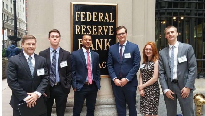
GVSU Fed Challenge Team, November 2017, Chicago-IL.