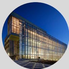
Mary Idema Pew Library Learning and Information Commons