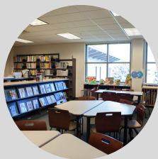
Curriculum Materials Library