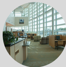
Frey Learning Center

Need assistance sharing your data, writing a Data Management Plan , or help with data management generally? The University Libraries can help.