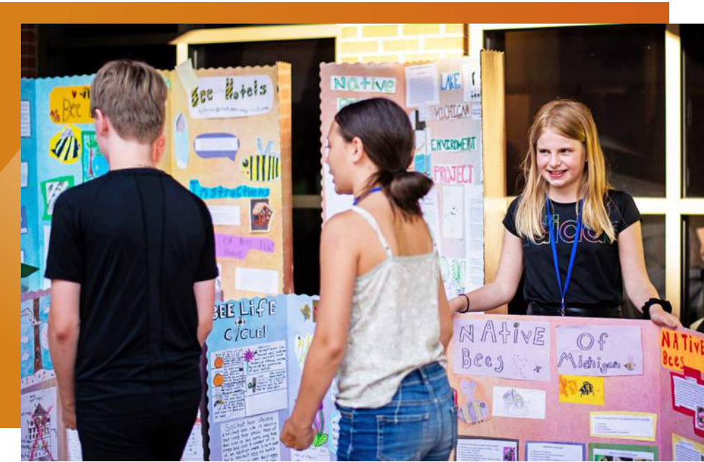
Students from a Montessori school participate in the GVSU Groundswell Stewardship Initiative student project showcase.

This is just one example of how the CSO is in position to join together various stakeholders to create solutions within public education. By opening more doors to meaningful insights, decisions for the future can lead to better opportunities for all kids and teachers. ♦