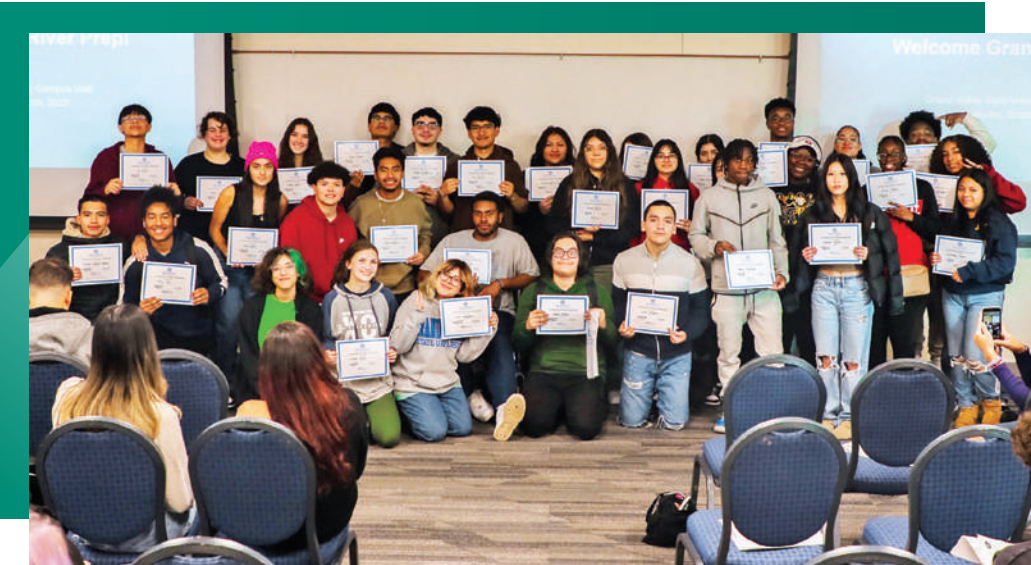
Visiting high school students celebrate their acceptance to GVSU.

The CSO's dedication to making higher education a reality for more students fosters an expanded, vibrant community of learners at GVSU. It furthers our mission to create an equitable learning environment where more voices and perspectives are included and enhances possibilities for future generations of lifelong learning. ♦