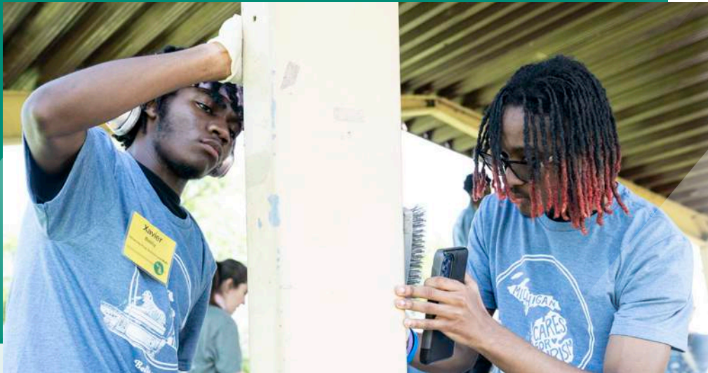
Students from UPSM High School add new paint to a park shelter.