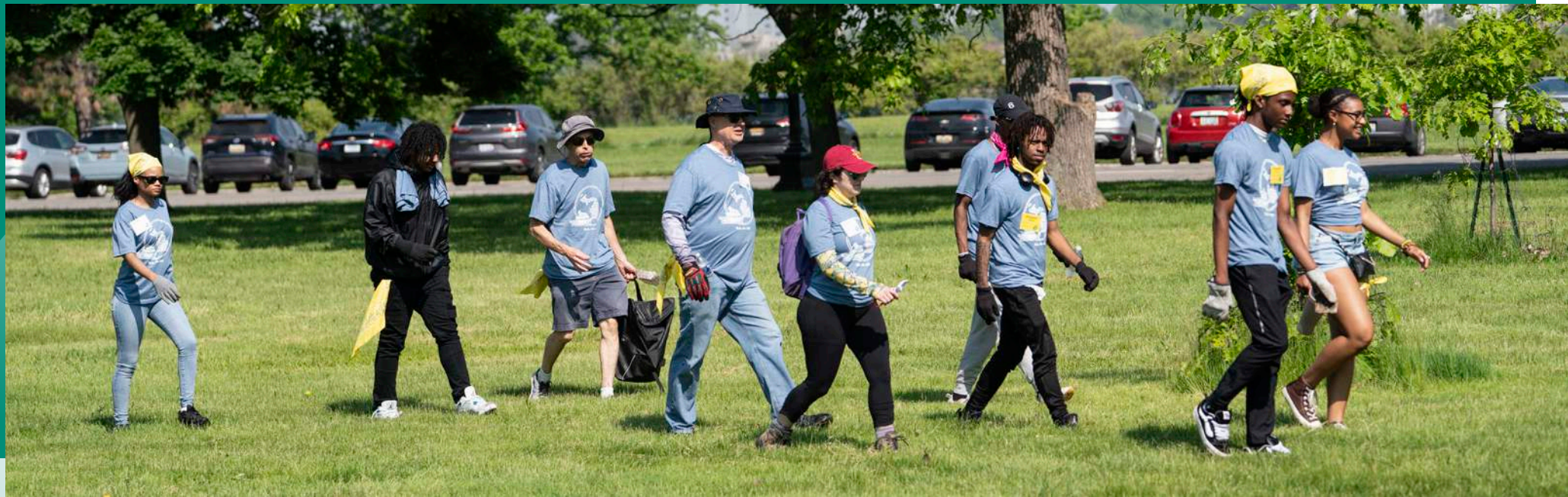
A group of volunteers head out to plant new trees on Belle Isle.

from industry professionals, the UPSM students also learned about the history of the park and good water safety habits. In the end, the K-12 students get an incredible experience while learning how important it is to maintain their community and its vital resources. Partnerships like this highlight what is possible through cross-department collaboration focused on helping students grow into good citizens and good neighbors. ♦