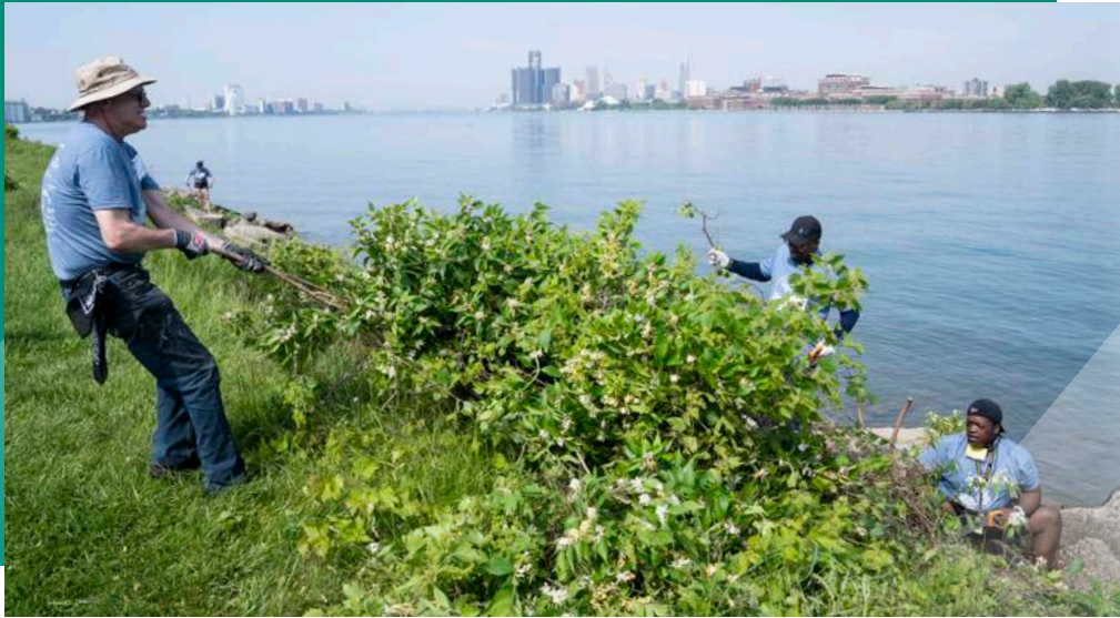
Volunteers clear brush alongside the Belle Isle shoreline.