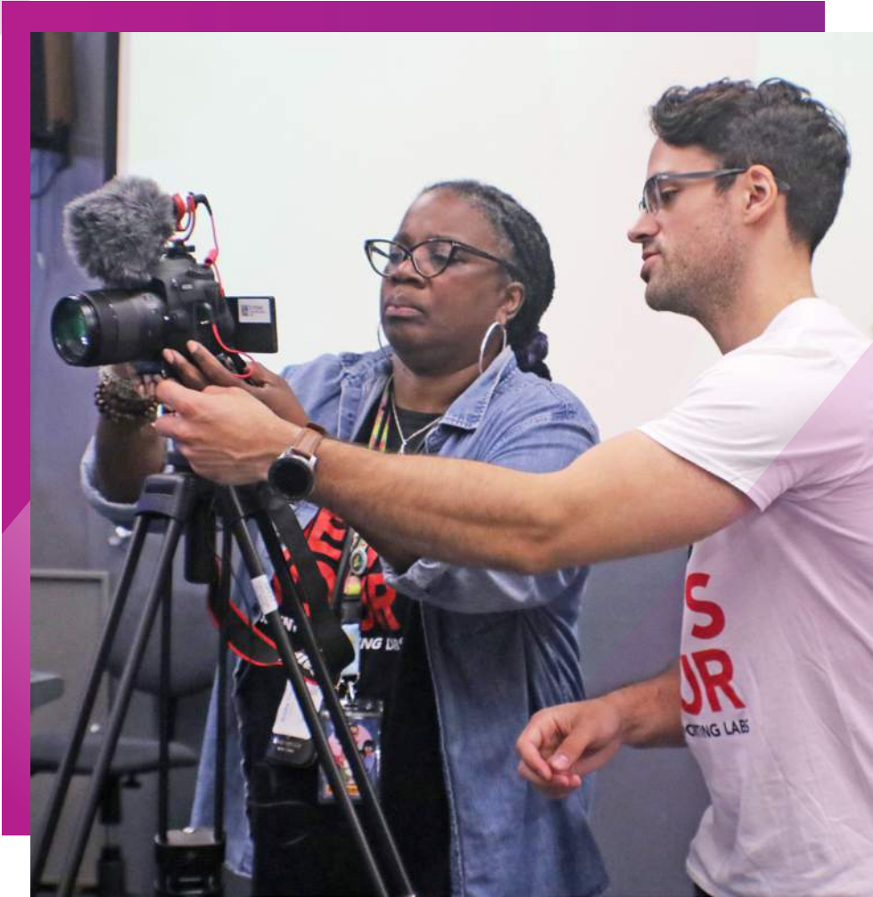
High school teachers test out camera equipment during a GVSRL workshop.

GVSRL uses a national database of journalism curriculum to help students develop skills around digital media, critical thinking, and communication. Students who participated in SRL explored topics they are curious about while telling their story through original news reports. The SRL partnership through Grand Valley enhances the program in a way that gives extra benefits to the schools and students who participate. When a classroom utilizes GVSRL, students also get additional support from undergraduate students at Grand Valley.