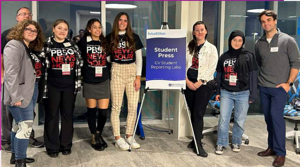
GVSRL participants at the futureEDlab ribbon-cutting.