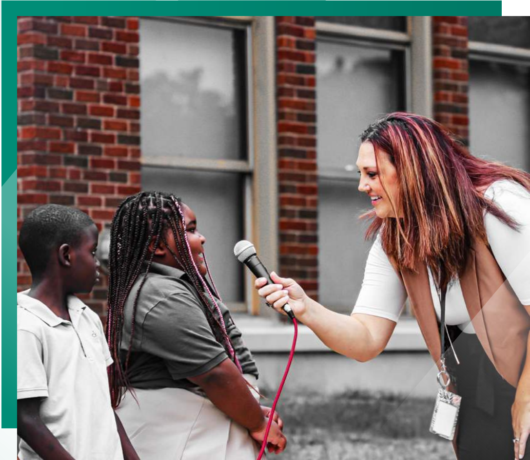
Students at Gerald Dawkins Academy share what they are excited about at their new school.

The fall of 2023 marked the launch of two GVSU-authorized charter schools that were founded in response to two different, but persistent, needs of K-12 learners in Michigan: (1) being able to read with confidence at an early age; and (2) learning in an environment where they felt safe and respected. Gerald Dawkins Academy, located in the heart of Grand Rapids, rolled out the red carpet for students as teachers and board members welcomed the inaugural cohort of learners on the first day of school. The school served 66 students in grade K-3 in its first year and will continue to grow into a K-5 school in years to come. The school has partnered with the Center for Sound Literacy Foundation to ensure more learners are proficient in reading when they reach 3rd grade.