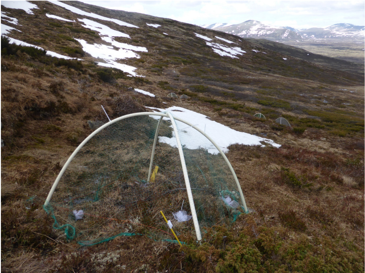
Figure 1: Pollinator access to Vaccinium myrtillus was experimentally manipulated using cages of varying mesh size, here exemplified by a pollinator reduction cage with relatively large mesh size.