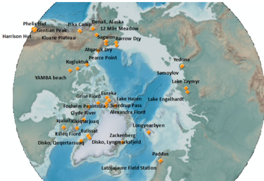
Figure 1: Locations where Cassiope tetragona samples were collected.