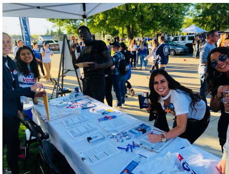
Registering to vote!