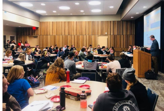
Prop 1: Should Marijuana be Legal in Michigan?