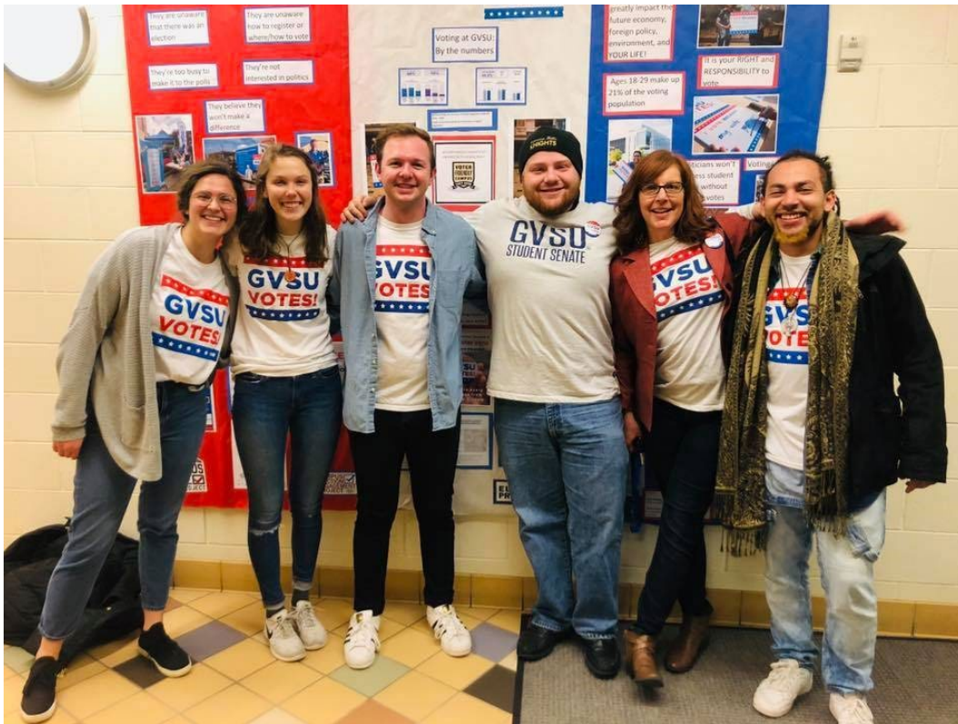
GVSU Democracy Fellows and student leaders