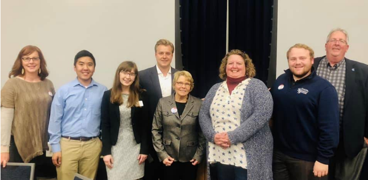
Laker Elected Officials Forum