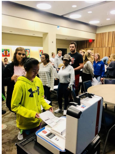
First Time Voter Workshop