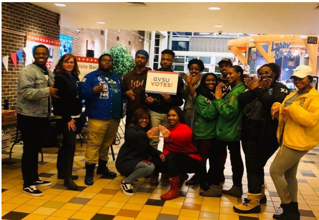
Black Greek Council "Stroll to the Polls"