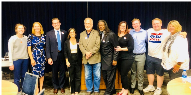
Proposal 3: Promote the Vote: A Michigan Voting Rights ballot initiative