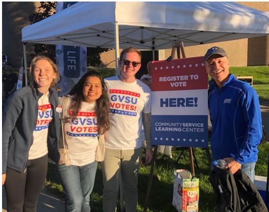
Dean of Students and student leaders