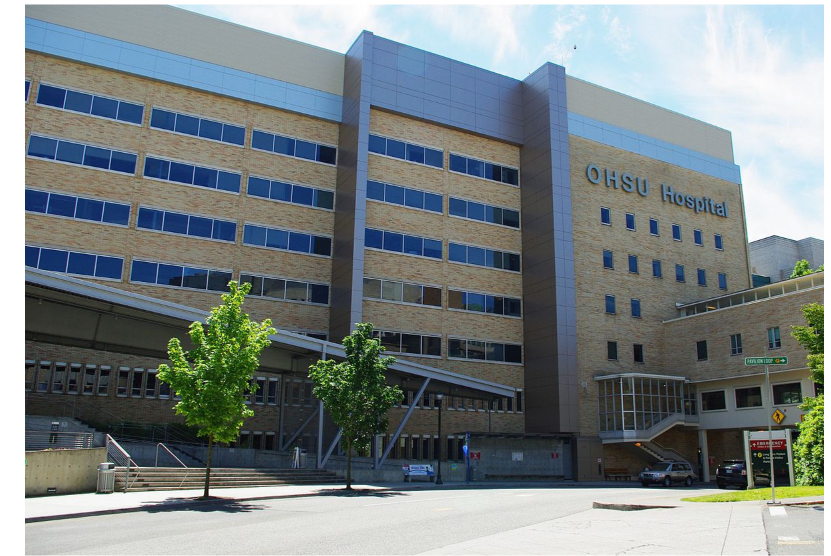
Fig. 4 Oregon Health and Science University Hospital