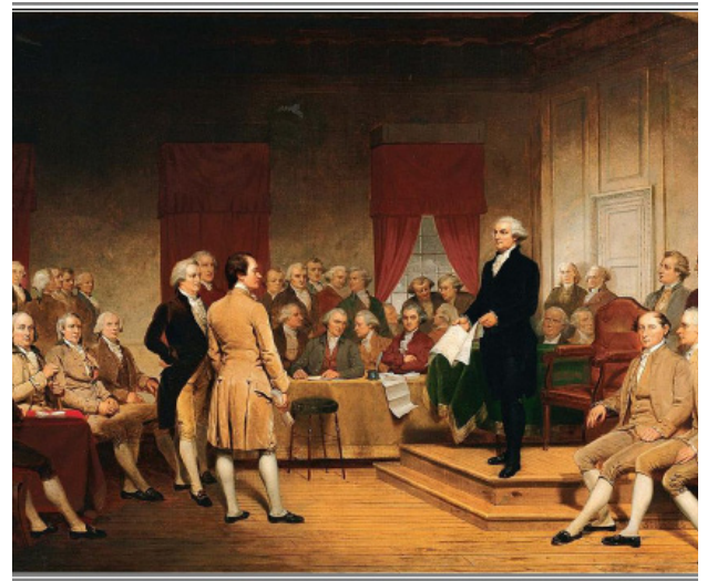
Constitutional Convention (1787)

Progressives live with irony, too. Not only have they relied on the ethical imperatives of our Judeo-Christian heritage more than is usually acknowledged, but they also behave like conservatives to insure the continuity of their ideas and institutions. They've certainly developed their own patrimony and orthodoxies. 10