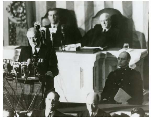
Pearl Harbor unified Congress