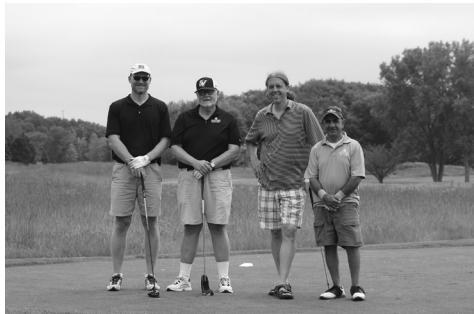
Participants from the 2015 CLAS on the Green golf outing are pictured. This year’s event is June 15; the annual Irwin Athletic Fund outing is June 2.

Driving range practice and registration begin at noon with a 1 p.m. shotgun start time. A cookout and celebration will follow the outing at 6 p.m. Cost per person is $95. To register, visit gvsu.edu/CLAS .