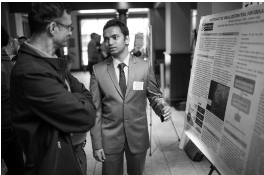
Last year's Graduate Showcase is pictured; the annual event showcasing research is set for April 19 at the DeVos Center.

More than 40 students will display their research and scholarly activities at the event set for Tuesday, April 19, at the DeVos Center, Loosemore Auditorium. Poster presentations will be held from 3:30-5:15 p.m.; poster recognitions will take place from 5:15-6 p.m.