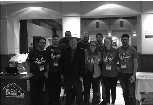
Housing and Residence Life staff members are pictured at the MiRA conference on April 9.

Attendees participated in a philanthropy activity recycling t-shirts to produce more than 150 tote bags that will be used by the Community Food Club of Grand Rapids.