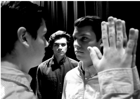
GVSU Opera Theatre will perform 'Godspell 2012' beginning February 5 in the Louis Armstrong Theatre.

For the past two seasons, Schriemer has cast alumni in each