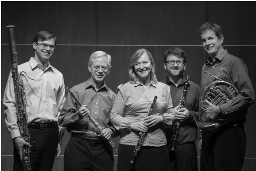
Grand Valley Winds will kick off the winter semester Arts at Noon concerts on January 27.