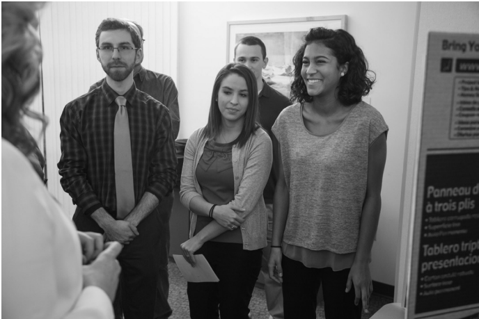
Students present their work to Spectrum Health Innovations staff members at an event in December.

School of Engineering through a collaboration with Spectrum Health Innovations, a subsidiary of Spectrum Health that helps health staff develop and launch original ideas, including health care products and technologies. Physicians and medical staff members come to SHI with ideas. Through the SHI/GVSU collaboration agreement, they work with students who are charged with developing the ideas and building prototypes.