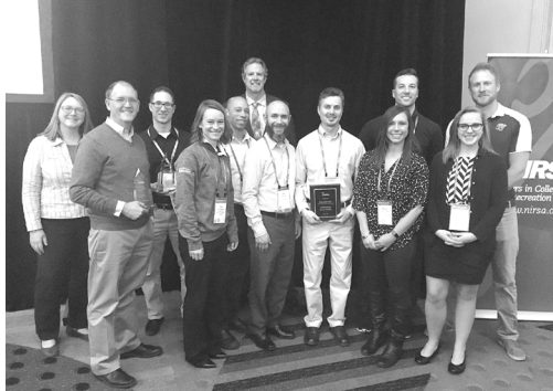
Staff members from Campus Recreation, Athletic and Recreation Facilities are pictured at the NIRSA Conference, after receiving the Outstanding Sports Facilities Award.

The GVSU Recreation Center won a NIRSA (National Intramural-Recreational Sports Association) Outstanding Sports Facilities Award, which recognizes excellence in newly constructed, renovated or expanded recreational sports facilities. In 2016, a $20 million renovation and expansion project added 50,000 square feet to the Rec Center.