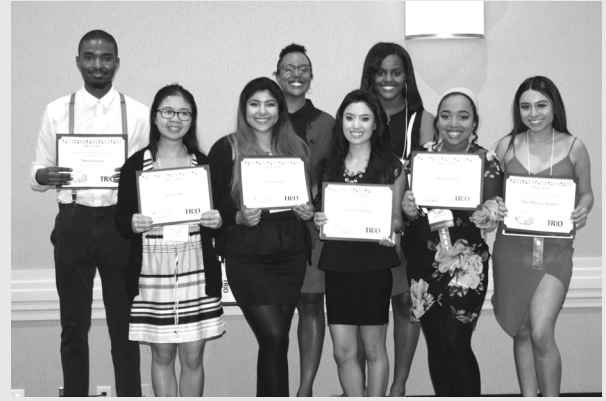
Students from four Grand Valley TRIO programs attended the Michigan Student Leadership Conference March 2-4. Hosted by Michigan College Access Programs and Personnel (MI-CAPP), the Rise Up Conference was held in Battle Creek and celebrated the value of TRIO programs on college campuses.