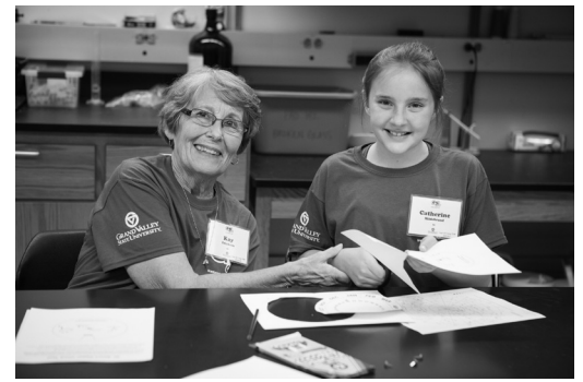
Participants from last year's G3 Camp are pictured. Registration is open for the 2015 camp.

Join the conversation on social media by using #GVSibs15.