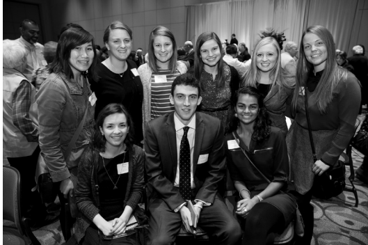
Students who presented 10 recommendations about how to retain talent in Grand Rapids are pictured at the State of the City address January 17 at DeVos Place.