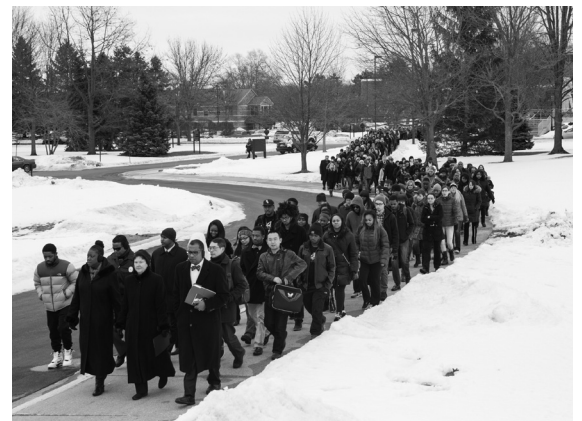
about 200 students participated in a Day of Service.

The week's events ended January 24, when