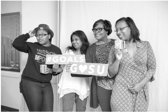
Attendees at EqualiTEA pose with props in a photo booth. The event celebrated the Women’s Center’s 15th anniversary.

Campus community members gathered March 20 to celebrate the Women’s Center’s 15th anniversary at its annual EqualiTEA event. Students, faculty and staff members enjoyed the centuries-old tradition of combining tea parties with conversations about politics and current issues. The 14th annual event took place in the Kirkhof Center.