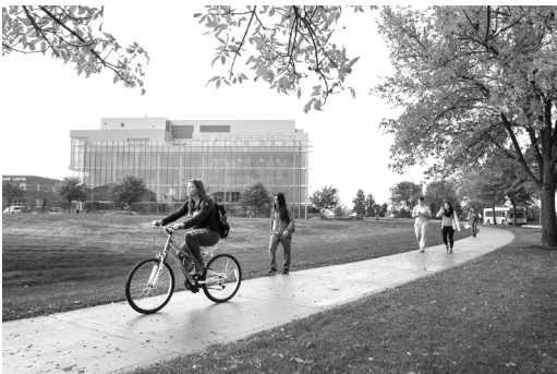
The League of American Bicyclists named Grand Valley a bicycle friendly university.

“This designation not only shows that Grand Valley supports bicycling as a recreation and transportation option, but it demonstrates the university’s ongoing commitment to sustainability and a healthy campus