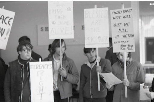
Archive photos of campus protests are on exhibit through February 22 at the Mary Idema Pew Library.

More information can be found at loveyourdata.wordpress.com/lydw-2017/ and participants are encouraged to Tweet with #LYD17 and #loveyourdata.