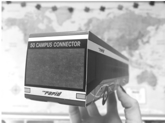
The Rapid Campus Connector is used as a bus bank in a fundraiser to collect donations to fund study abroad opportunities for students.