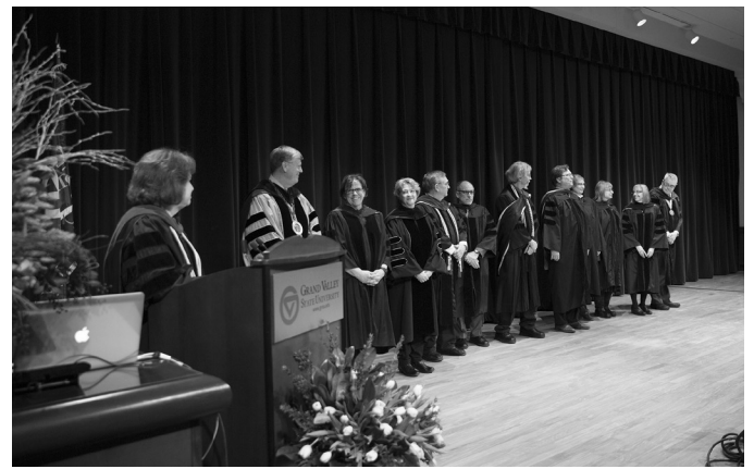
The annual Faculty Awards Convocation is set for February 1 at the DeVos Center. The 2017 event is pictured.