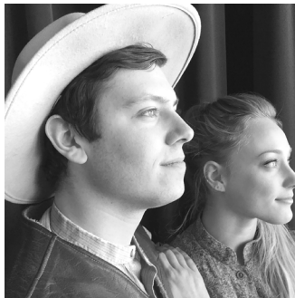
Performances of 'Oklahoma!' run February 2-11 in the Louis Armstrong Theatre.

Running for more than 2,000 performances, "Oklahoma!" opened on Broadway in 1943. It has stood the test of time — raking in a 1944 Pulitzer Prize, numerous Tony Award