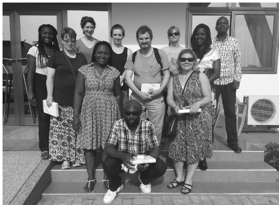
The partnership delegation to Ghana in 2014 is pictured. In June seven faculty and staff members will travel to Japan to visit three partner institutions.