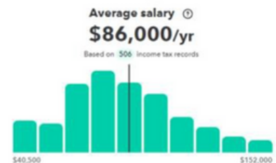
Electrical Engineer salary in Michigan