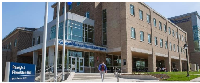
Raleigh J. Finkelstein Hall (RFH)