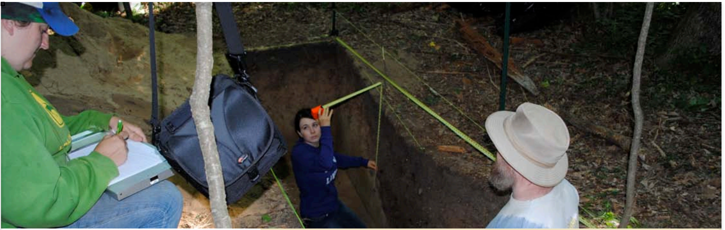
Above: 2012 student excavations at Connor Bayou