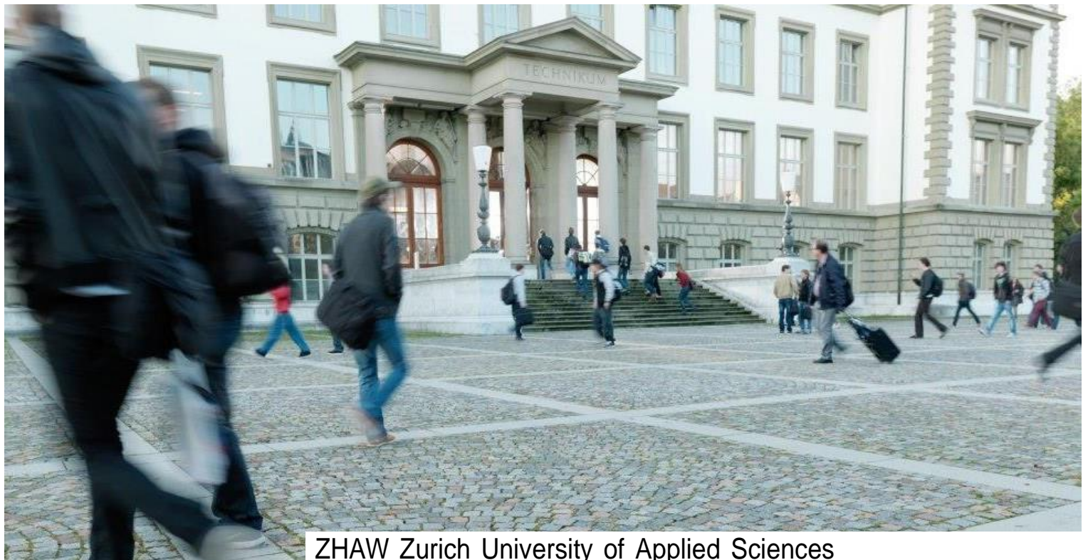
ZHAW Zurich University of Applied Sciences

The ZHAW is one of Switzerland's largest multidisciplinary universities of applied sciences with more than 11,000 students enrolled in Bachelor's and Master's programmes and over 4,000 people registered in continuing education courses. The university's primary focus is on practice-oriented research and development as well as on providing its graduates with an optimal preparation for professional life. Equally important to the ZHAW is that both teaching and research are scientifically based. Close interaction between theory and methods is just as much a part of the programmes as the direct practical relevance.