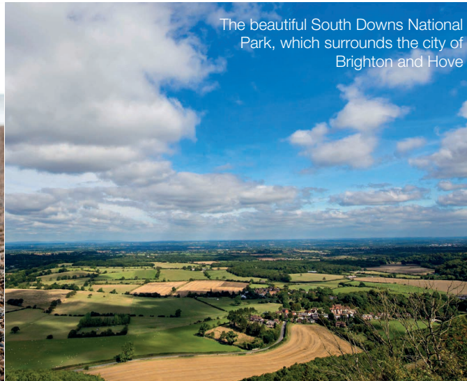
The beautiful South Downs National Park, which surrounds the city of Brighton and Hove