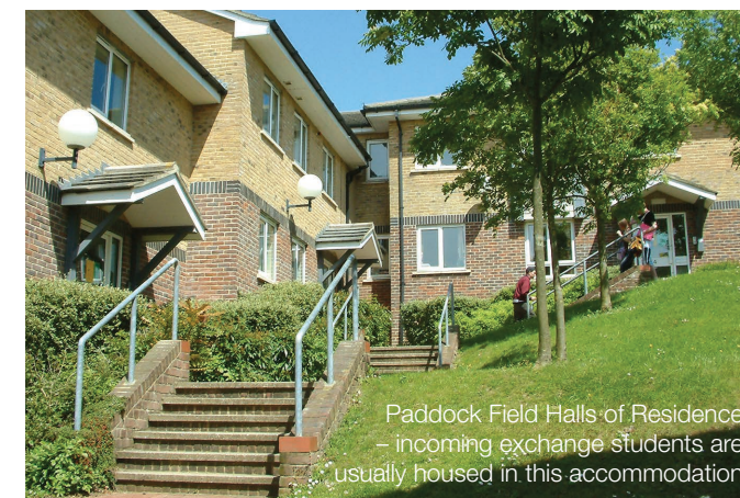
Paddock Field Halls of Residence – incoming exchange students are usually housed in this accommodation

Please also note that the vast majority of UK landlords will only issue a housing/room contract for a minimum period of 6 months. Although your exchange semester may be less than this, you may still be expected to pay the full 6 months' worth of rent. This is something to be aware of when looking for your own private accommodation.